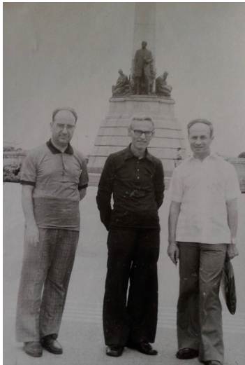
At the Luneta Park, 1980

After finishing his mandate as Vicar General, he was invited to go to the recently opened mission in the Philippines. In fact, he once confided in an interview, "Since the very first moment, [I have resolved that] when I finished my duties in Rome and if the Superiors would send me to the Philippines, I would go willingly." Notwithstanding his advanced age and the lack of knowledge of the English language, he willingly left with the Fr. General's reassuring words: "Do not worry about the language; your 'elderly' presence will be useful for the formation of our young seminarians. Just go, at least for a year." So on November 5, 1980, at the age of 62, he arrived in the Philippines where he remained not only for a year but for 30 years!