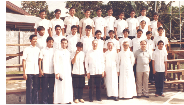
With Filipino Religious Brothers - Manila, 1982

While faithfully carrying out this assignment, he dedicated himself also to teaching Italian and Latin classes, giving conferences and preaching in spiritual recollections and retreats, hearing Confession, and spiritual direction to seminarians and numerous aspirants and religious of different male and female congregations in the area. He became the common point of reference as source of guidance and spiritual support to several Italian missionaries particularly those who just arrived in the Philippines to start their Congregation. One of them attested: "All who knew him especially religious men and women, had a great respect of him for his fatherly kindness, for his wisdom in counseling, for his rich inner life and spirit of prayer, for his simplicity and exemplary life as religious and missionary priest."