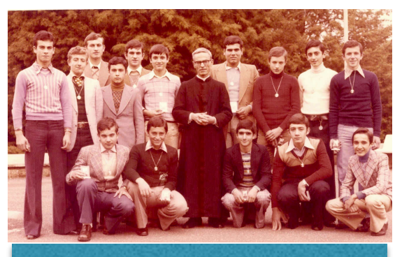
As Vicar General on a visit in Zagarolo, Rome, 1975

He was highly esteemed by the Confreres so much so that in the General Chapter of 1974 he was elected Vicar General of the Congregation and Councilor for Religious Life. (To be continued...)